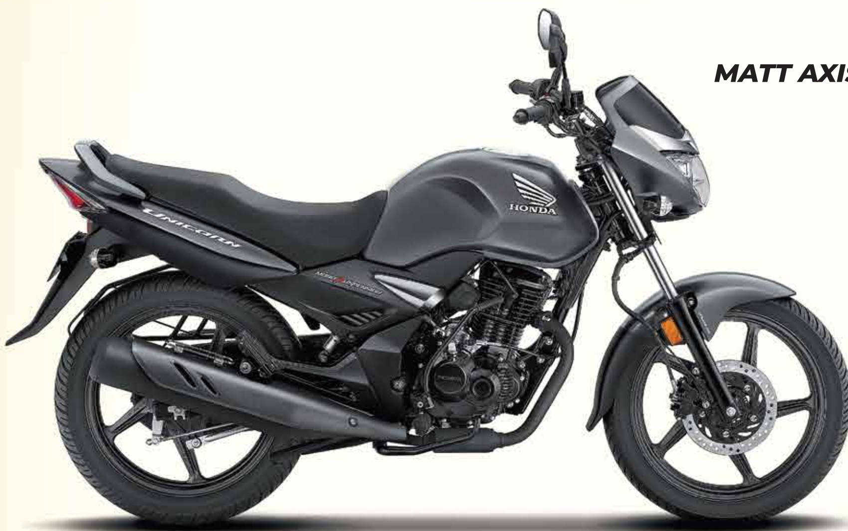
MATT AXIS GREY METALLIC